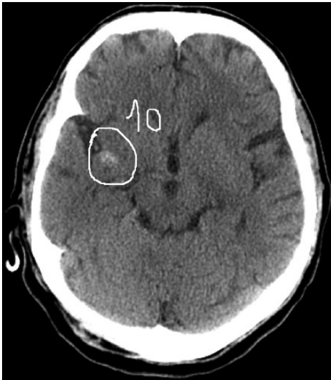
Figure 3. Inserted hemorrhage encircled and rated on a confidence scale of 1 to 10 by one of the participating radiologists (Venjakob, 2015).

area of interest (AOI), dwell time per AOI, and the number of slices covered by one fixation.