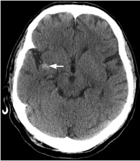
Figure 1. Slice with inserted intracranial hemorrhage indicated by an arrow (Venjakob, 2015).

case were exported as uncompressed 8-bit Portable Network Graphics images. Then 18 subtle hemorrhages were cut from more severe cases displaying multiple lesions and were pasted into 10 initially healthy cases, which resulted in 10 normal and 10 abnormal cases. The number of hemorrhages per abnormal case varied between one and three: Four cases contained one hemorrhage, four contained two hemorrhages, and two cases contained three hemorrhages. Four of the hemorrhages were displayed only on one slice, 12 hemorrhages spanned two slices, and two hemorrhages spanned three slices. The effect of the image manipulation was assessed by three radiologists who did not participate in the study. These radiologists did not realize they were looking at inserted hemorrhages, which led us to conclude that the insertions were successful. Figure 1 shows an example of a case with an inserted hemorrhage, indicated by the arrow.