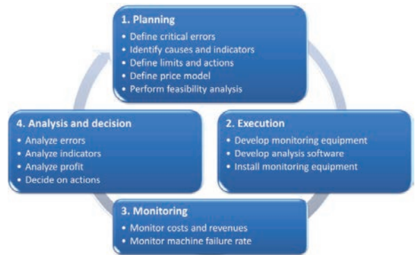
Fig. 4. Proactive maintenance process cycle.

The findings which are presented in the following conclude the state of the art described in chapter 3 and the case study presented in chapter 4. They comprise a generic proactive maintenance process cycle and the comprising activities. The process cycle has been developed based on the results of the interviews and workshops including iteration and evaluations with the case company. The activities for providing proactive maintenance are defined in a process cycle (cf. Figure 4) which follows the principle of continuous improvement and contains the phases “planning”, “execution”, “monitoring” and “analysis and decision”.