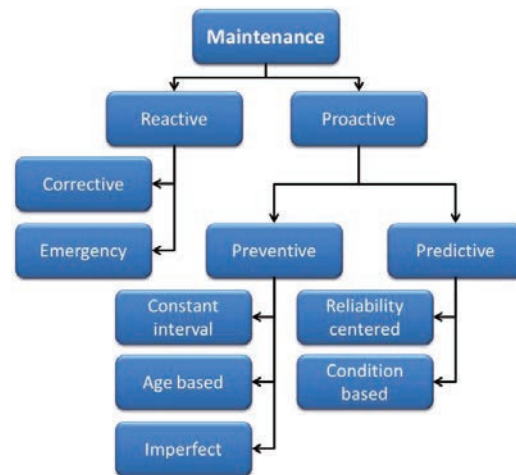
Figure 1. Taxonomy of maintenance philosophies. [12]

In general two maintenance strategies are described in literature - reactive and proactive maintenance. Reactive maintenance is unplanned and takes place after error emergence. Proactive maintenance is planned and is performed before an error occurs. Furthermore, proactive maintenance differs in preventive and predictive maintenance. Performing preventive maintenance means to maintain the machines dependent on fixed time intervals (e. g. every year) or dependent on the use of the machine (e. g. every 10.000 operating hours). In contrast predictive maintenance is based on the actual condition of the machine. The condition of the machine is monitored continuously and if limit values are exceeded the maintenance could be conducted before an error occurs. This so called condition based monitoring is becoming more and more relevant in industrial practice. [11] The described taxonomy of maintenance philosophies is illustrated in Figure 1: